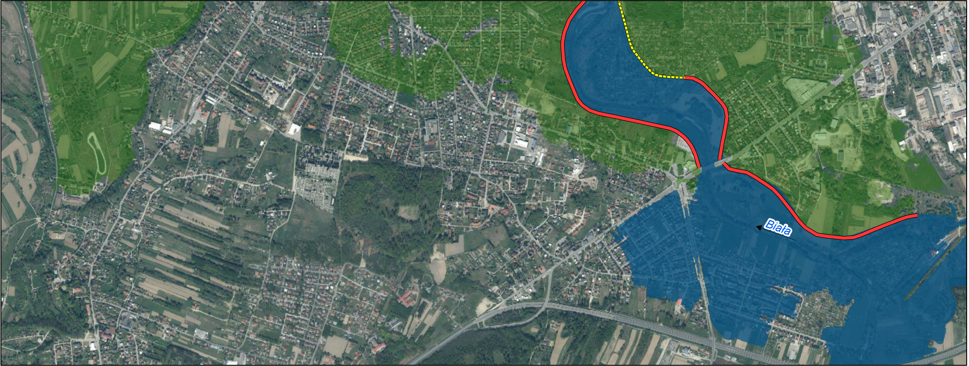
Appendix No. 8: Map with location of the Contract in reference to areas excluded from potential flood risk