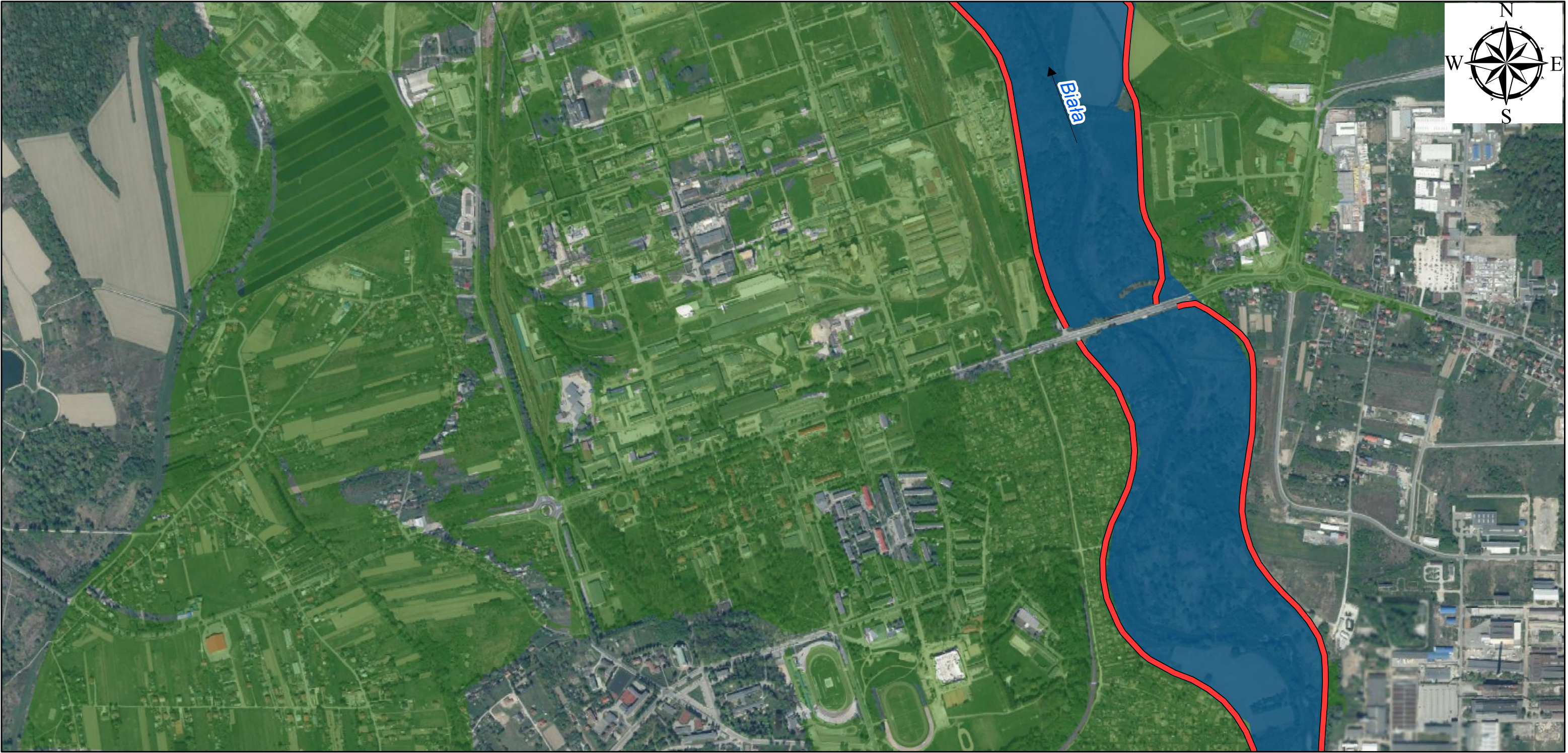
Appendix No. 8: Map with location of the Contract in reference to areas excluded from potential flood risk